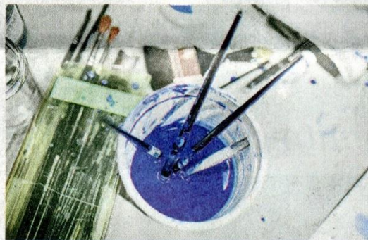
The artist Spencer Finch, 51, at his studio in Brooklyn, with part of his work for the Sept. 11 memorial, top, and his watercolor blues, above.

And when he was chosen more than two years ago to create the only work of art commissioned for the National September 11 Memorial Museum, he knew that the sky — or more accurately its continued existence in collective memory — would be his subject. The problem was how to find a way to get at something so evanescent and powerfully evocative. "It had to be believable," he said, explaining what believable meant to him in such a case: "It had to be about that human quality of remembering, how it's so fuzzy in